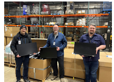
The first of several computer deliveries to the Anchorage School District warehouse.