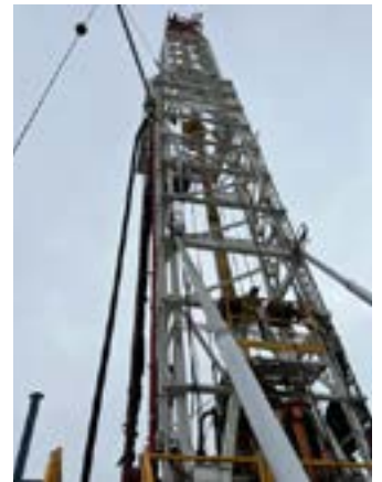
A drilling rig at the Beluga River gas field in Cook Inlet.

Phase 2 of the Black & Veatch study, expected to be completed by the end of the year, will further investigate the costs, timing, and viability of LNG options.